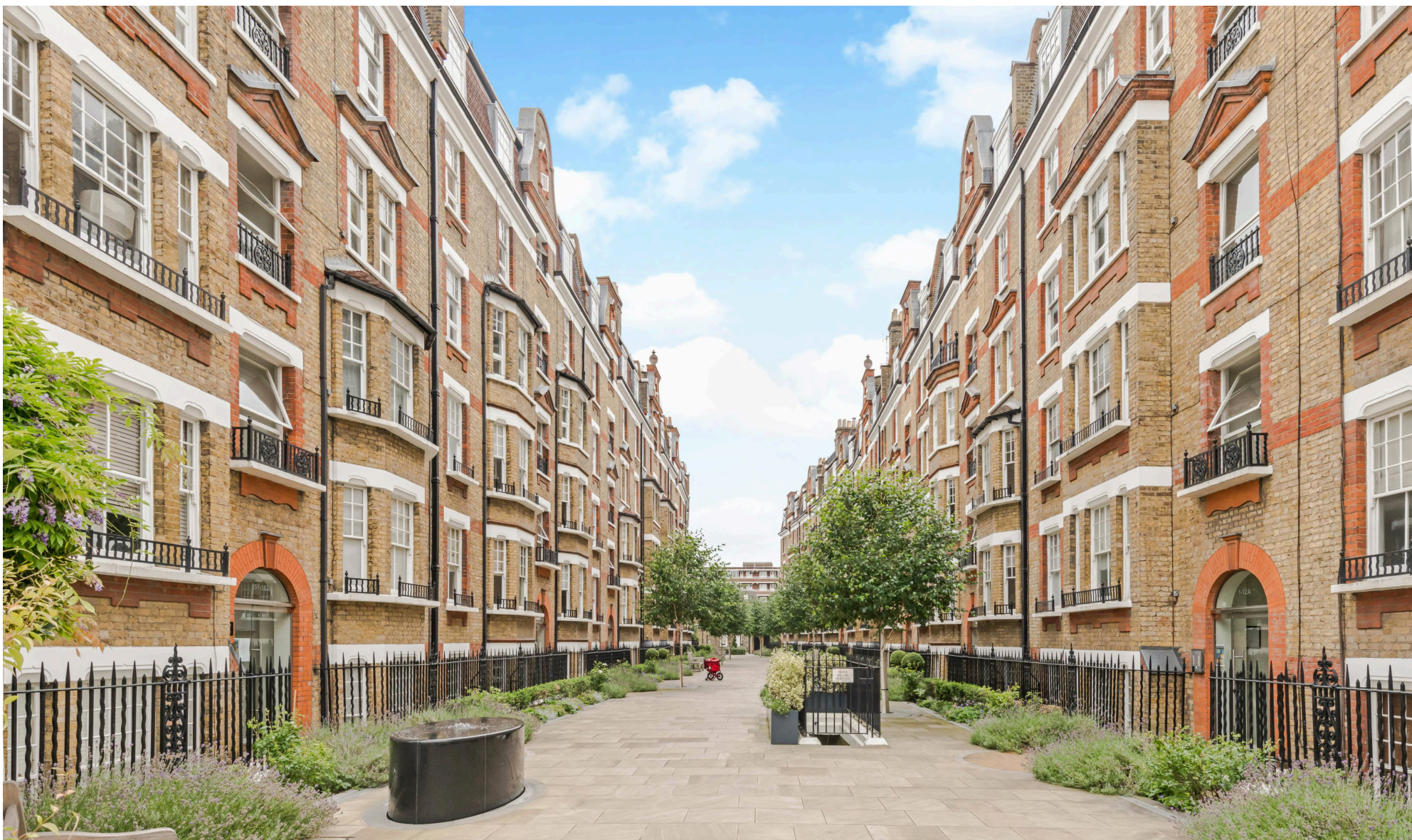
Walton Street, Chelsea, SW3